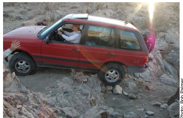
The 5 stages of Joe Aiello climbing a rock face in his red Range Rover SE. Starting in front of the rock face (top right above), through climbing with the front tires, straddling the edge between the front and rear tires (rock sliders are really helpful here), to climbing with the rear tires (above), to all the way on top (left).