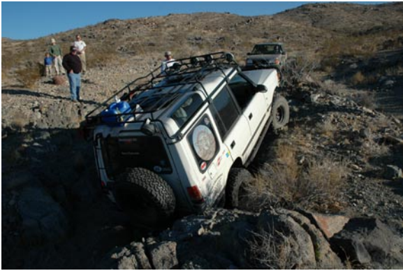
Photos: Above: Olaf gets an assist winching off Bob's Range Rover Below Left: Olaf discusses the track to take with Roy before descending through a rocky section in his LR3 Below Right: The steering stabilizer broke on Olaf's Disco I

Sunday morning we packed up, and headed east over some more hills. From the top of one of these hills, we could see our destination for lunch, the Slash X restaurant and bar on Hwy-247. After lunch, we headed back to our starting point by the flat well travelled dirt roads through the desert valley floor. Back on pavement, we aired up our tires and headed home.